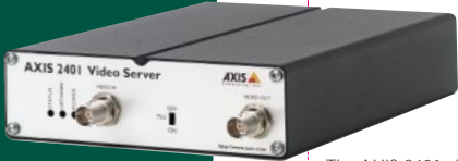
The AXIS 2401 video server comes in two versions: the AXIS 2401 PAL and AXIS 2401 NTSC. They both support a single video source and are equipped with an analog video loop-through connector.

The comprehensive single box solution for realtime digital video transmission.