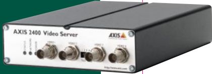
The AXIS 2400 video server can monitor up to four video sources (NTSC/PAL).

AXIS video servers are based on the industry's first dedicated digital video surveillance compression chip, the ARTPEC-1, and the ETRAX 100 - a processor optimized for Ethernet networks. Both chipset designs were developed by Axis. The design-synergy yielded by this advanced chipset technology provides a cost-effective solution that delivers up to 30 high-quality images per second over 10/100 Mbps networks.